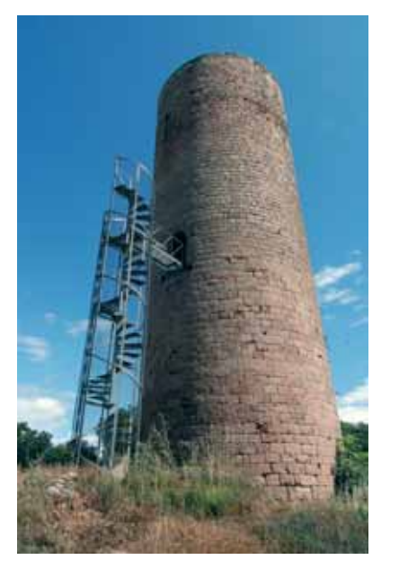
The Manresana tower

The tower became a strategic observation post for the allied command while Starhemberg and his chiefs of staff installed themselves in a nearby manor house, the troops being deployed between Can Selva and Puigforner. The Bourbon troops, meanwhile, were deployed between Calaf and Sant Martí de Sesgueioles forming a front that encircled Els Prats de Rei from Albareda to Solanelles. After the allied encampment had been bombarded by Bourbon artillery, marshal Starhemberg ordered Els Prats de Rei to be occupied to prevent its capture by the duke of Vendôme.