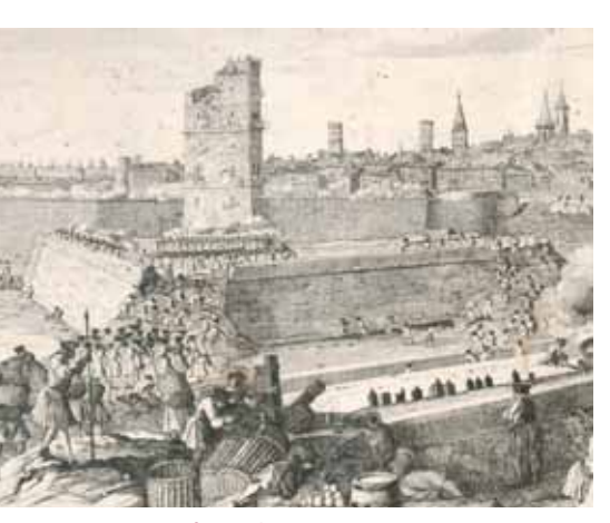
Siege of Barcelona, 1714, in an engraving by J. Rigaud (AHCB)

The War of the Spanish Succession, between 1702 and 1715, was also a long civil war at the heart of the Spanish Crown. In 1705 Catalan supporters of the House of Austria signed a pact with England and lent their support to the allied landing. On 7 November the Archduke officially entered the city of Barcelona and was proclaimed king, with the name of Charles III. Broadly speaking, the kingdoms of the Crown of Aragon favoured Charles while Castile favoured the House of Bourbon.