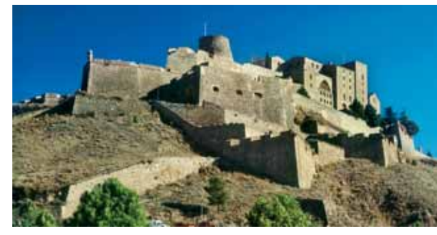
Cardona castle (Pepo Segura)

Following the orders issued in Calaf by the French duke of Vendôme, lieutenant general the count of Muret went to Cardona with 25,000 troops. He took the town on 17 November 1711, but not the castle, which was bombarded with cannon-fire for thirty-four days. One of the fiercest engagements over the control of the castle took place