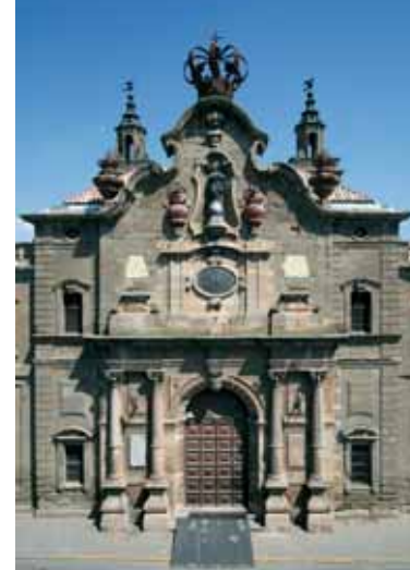
Facade of the University of Cervera (Paeria de Cervera)

The University of Cervera is, without doubt, one of the most monumental works of 18th-century civil Catalan architecture. It is organised around two courtyards separated by a chapel or central hall with a splendid Baroque alabaster retable by Jaume Padró. Notable features are the two exterior facades, built during the first half of the 18th century in Baroque style and presided by a representation of the Immaculate Conception, over