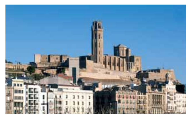
General view of the hill with the Old Cathedral surrounded by bastions (Pepo Segura)

ings that had survived the Reapers' War of 1640-1652 were demolished by Philip V's engineers and the stone used to build the fortress that stands today.